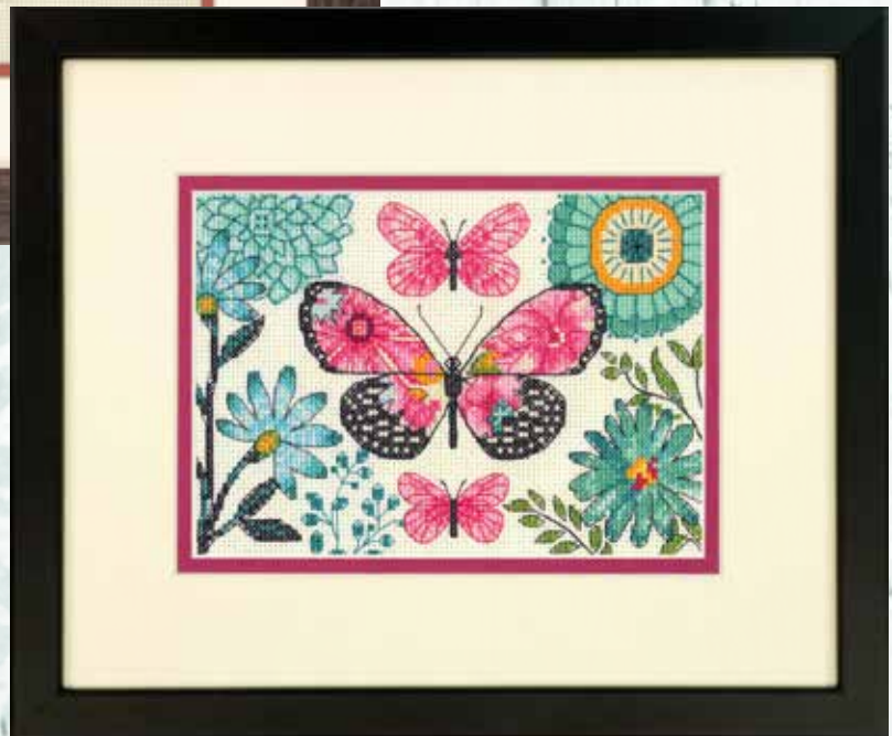
70-65178 | Butterfly Dream